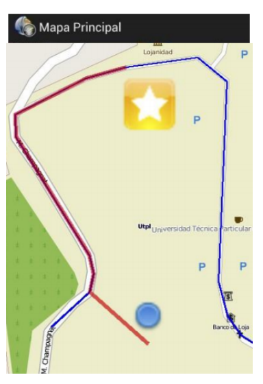
(b) Scenario 1: Downtown Loja